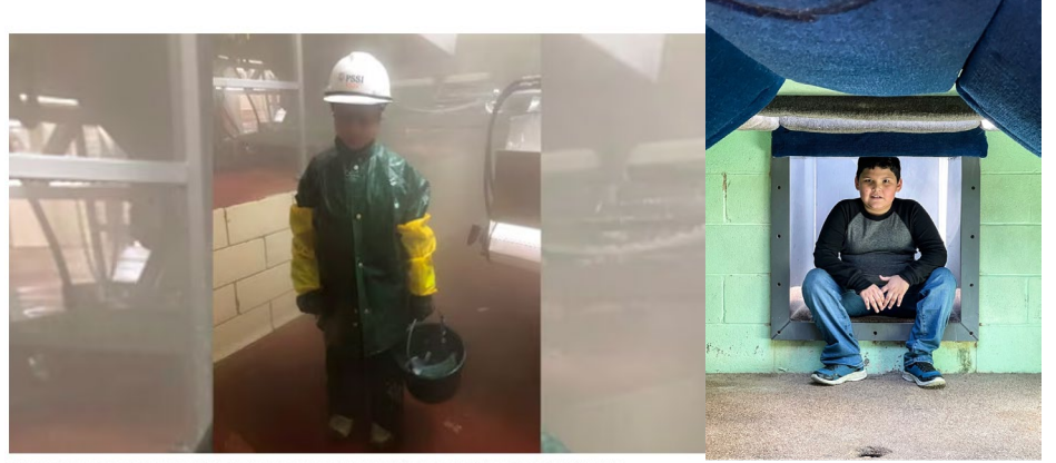
Images released by the US labor department show children working illegally for PSSI.

Portfolio Company #1: <u>Packer's Sanitation</u> Portfolio Company #2: <u>Center of Autism and Related Disorders (CARDS)</u> Blackstone Capital Partners, 2016- <u>Blackstone</u> & Exploiting <u>Child Labor</u> & <u>Children with Autism</u>